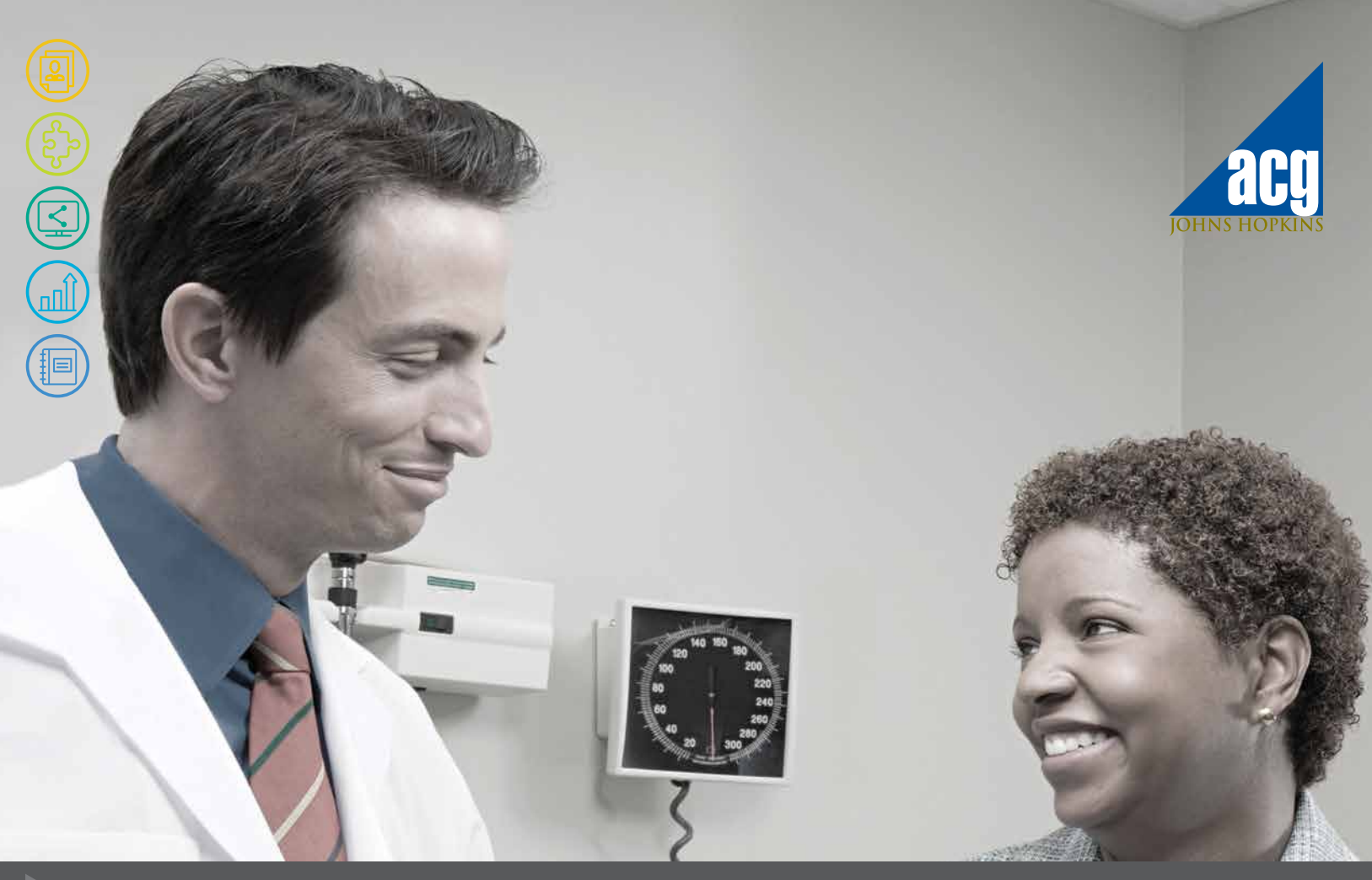
PROVIDER PROFILING AND ENGAGEMENT - PAYER